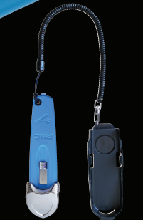
UKH-545 Safety Holster & CL-36 Coiled Lanyard Available