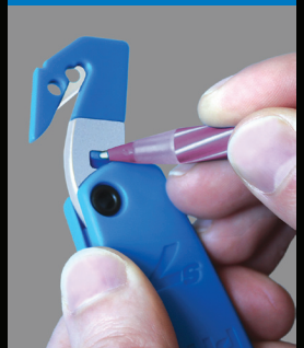
FILM CUTTER CHANGE Use ball point pen (above) to remove & replace film cutter unit.