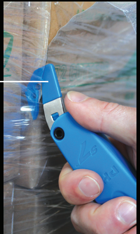
Easily Cuts Shrink Wrap