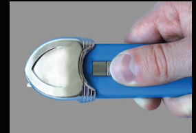
Tray Cut C Position For Minimum Blade Depth