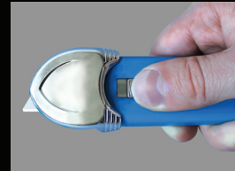
Tray Cut B Position For Medium Blade Depth