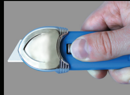
Tray Cut A Position For Maximum Blade Depth