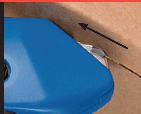
Continue your cut, letting friction of box maintain blade exposure. Blade guard will automatically relock at the end of the cut.