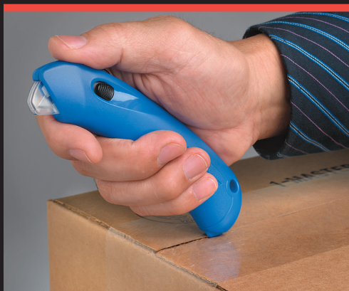
Built-in tape splitter.

Keep hands on the opposite side of the box top you are cutting.